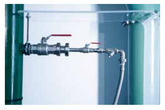
{\tt SOLVOX}\ in line\ injector\ in stallation.

The low investment costs for SOLVOX® oxygen injection equipment, including measurement and control unit, quickly pay off through reduced need for maintenance, repair and restoration work, and odor control programs: SOLVOX efficiently improves wastewater purification.