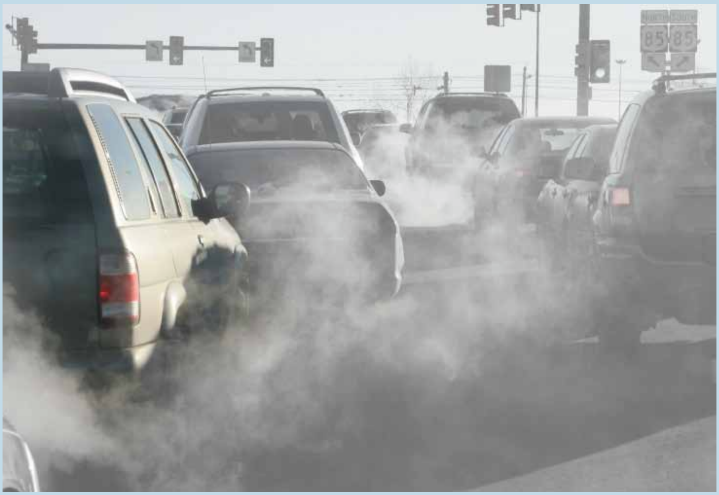
Car exhaust emissions