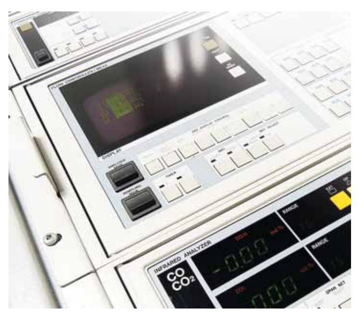
Infrared analysers used in Environmental monitoring