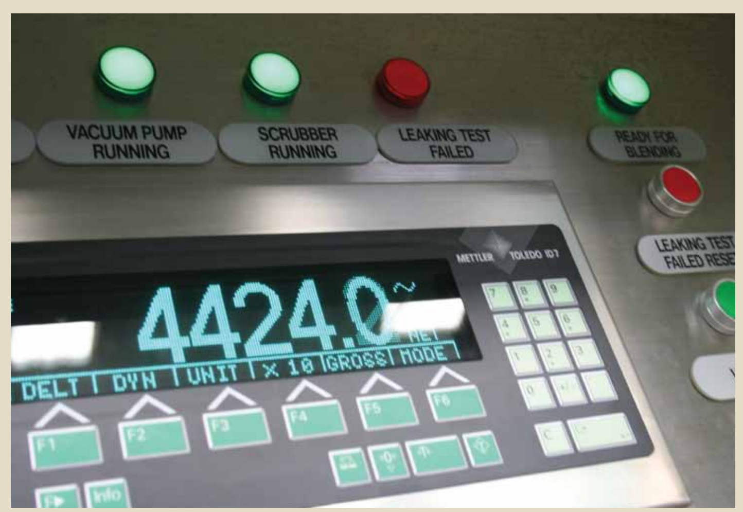
Precision filling starts with cylinder preparation