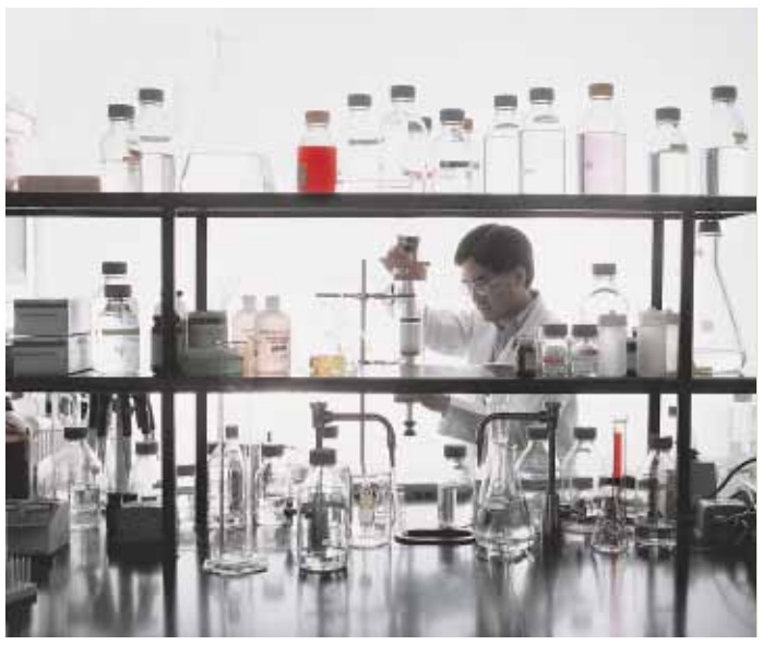
Research and testing

Linde produces and stocks a wide variety of pure gases and gas mixtures used across a variety of market sectors. These include lighting mixtures, automotive test gases, food packaging mixtures, laser mixtures (premix and pure gas), welding mixtures, refrigeration and sterilisation gases.