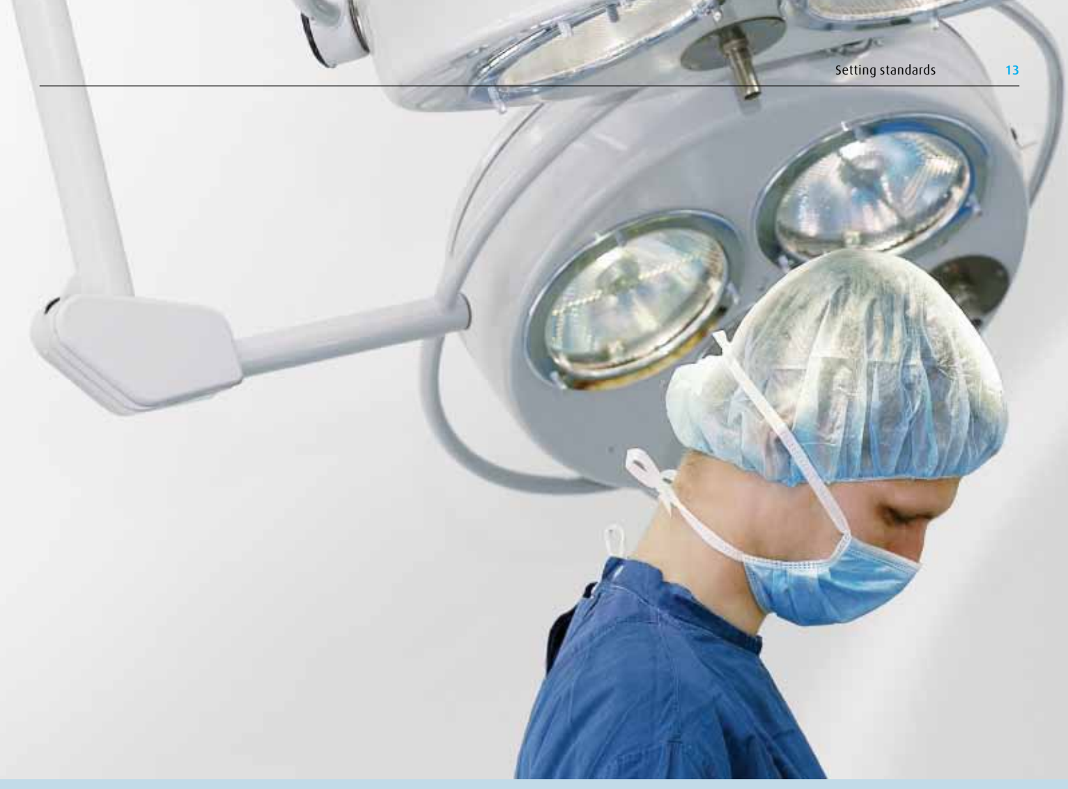
Xenon lighting for theatre surgery