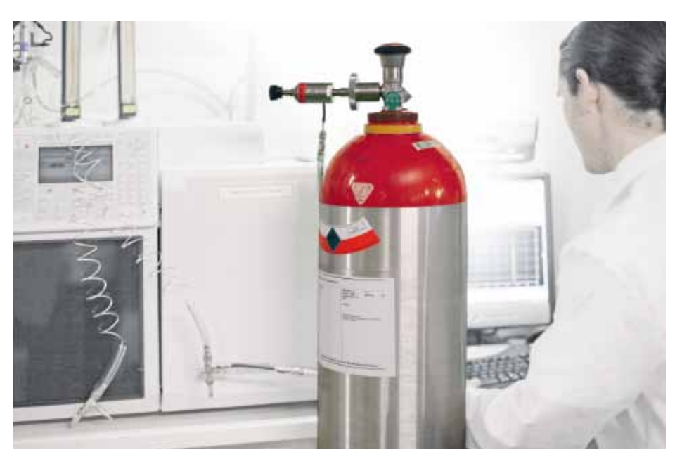
HiQ® gas mixture for Gas Chromatograph (GC) calibration