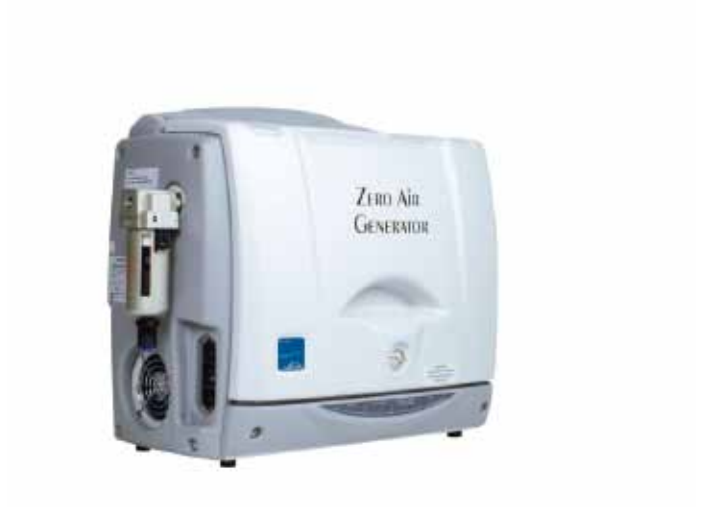
HiQ® Zero Air Generator