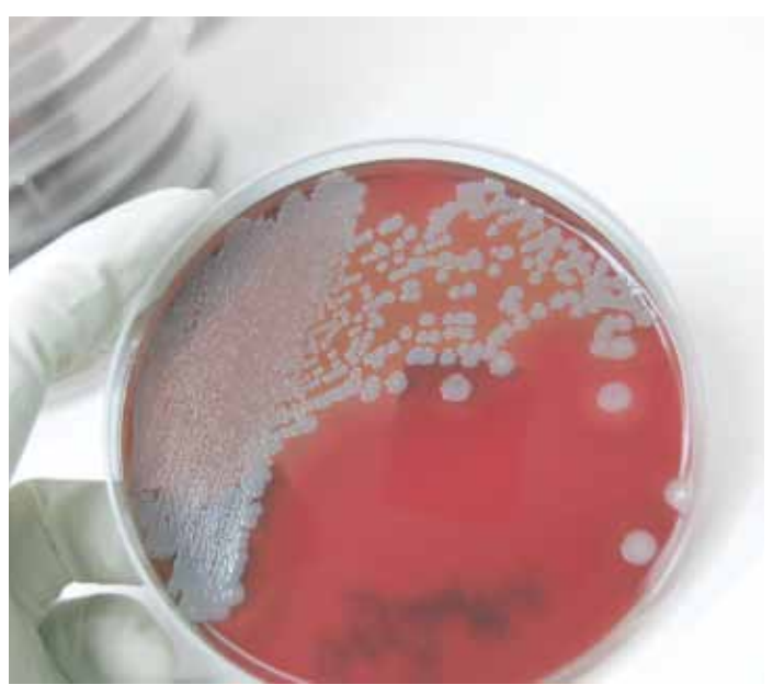
Anaerobic culture growth